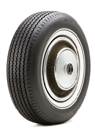
Optional Jubilee Style