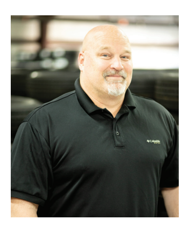
Hyde Abbott Sales