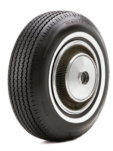
<sup>3/</sup><sub>4</sub> " White 225R15 1979