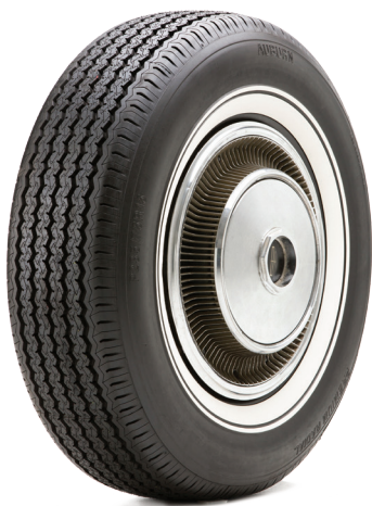
Optional Jubilee Style