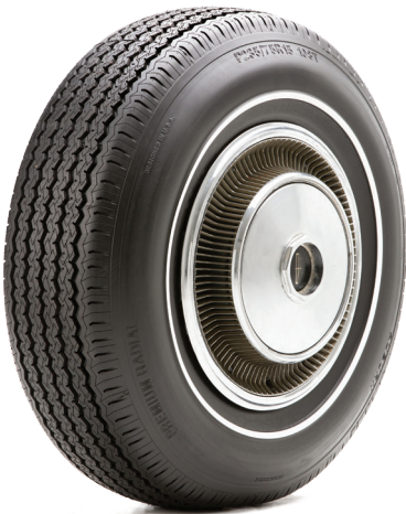
3/8" White 225R15 1970-72 230R15 1973-75