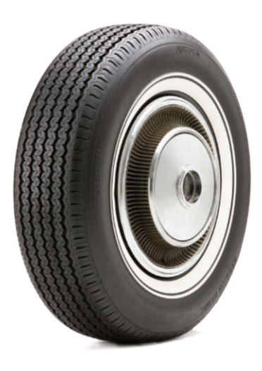
Optional Jubilee Style