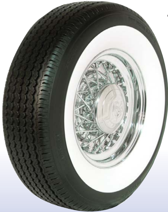
205/75R15 - 205/70R15 - 185VR15 Coming Soon Many more sizes to come.... stay tuned!

New Professionally Designed Molds With Period Correct Tread Style