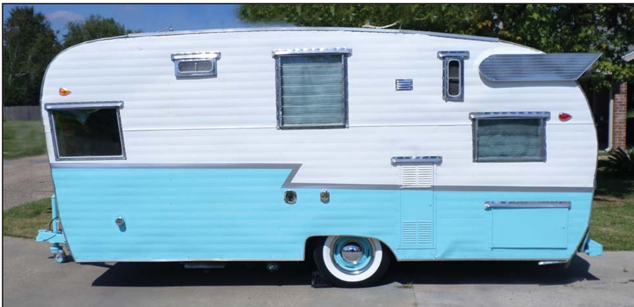
1960 Shasta Deluxe 19'