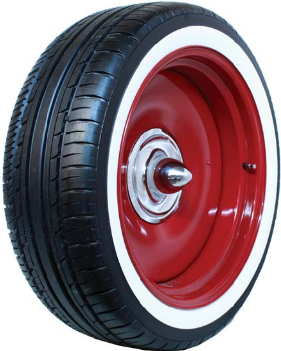
20" Rim

TIRE SIZE HEIGHT WW WIDTH TREAD WIDTH SECTION WIDTH LOAD INDEX* RIM WIDTH PRICE