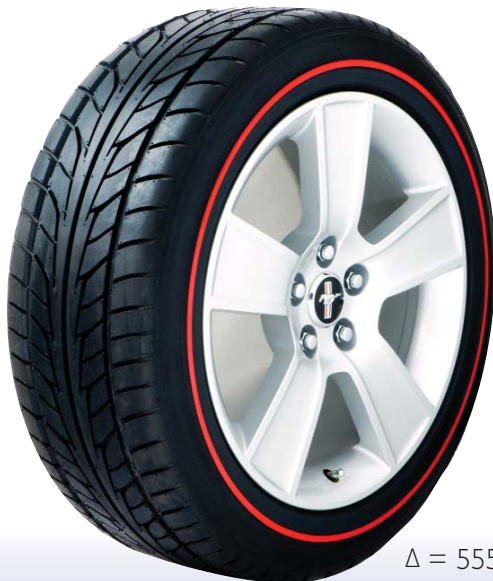
Δ = 555 Design

TIRE SIZE HEIGHT WWV WIDTH SECTION WIDTH LOAD INDEX* APPROVED RIMS PRICE