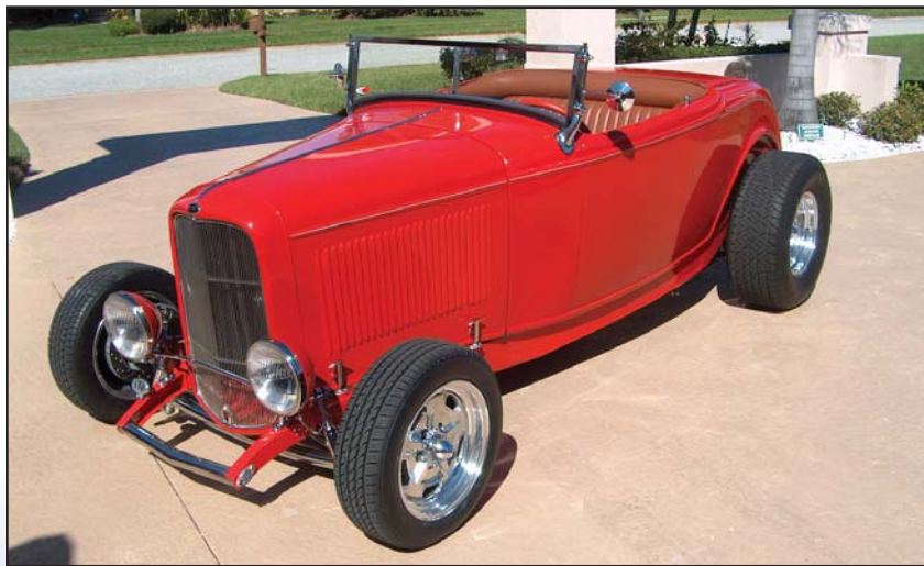
Odd Rodd Creations, Builder Rusty Jackson

Smoothies are designed for pre 1948 cars. For cars after 1948, Federal law requires that we leave all required DOT information on the tire's sidewall. This information will be located in the lower bead area.