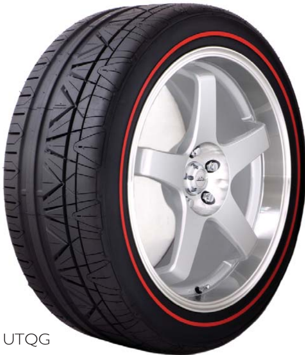
UTQG 260 AA A

The inner shoulder has a continuous rib formed from a single, solid block. This design increases the tire's rigidity and stability. This rigid design keeps you connected to the road during hard braking and acceleration.