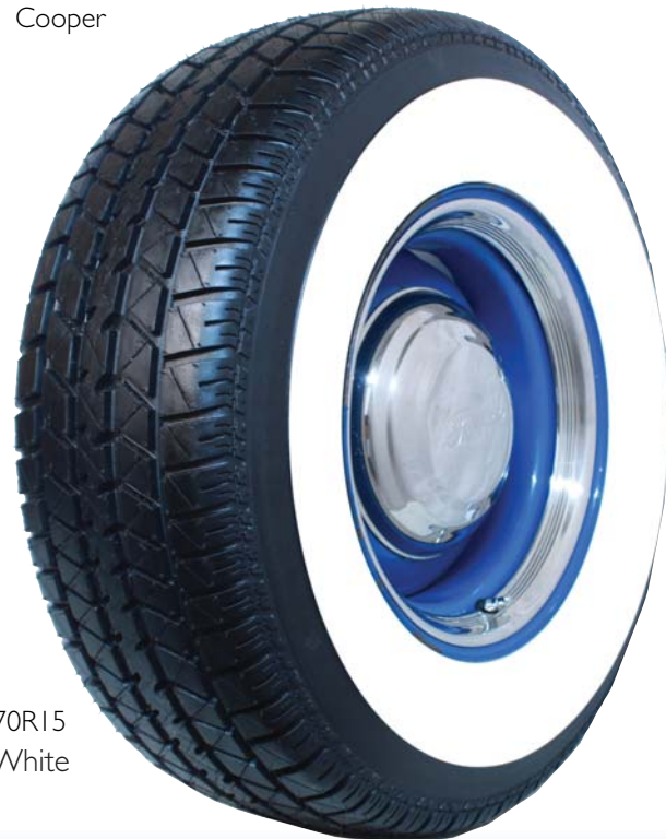
255/70R15 3/4 White