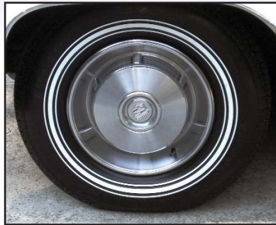
Style C - Triple Stripe