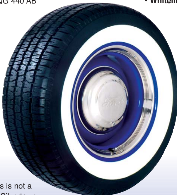
This is not a BFG Silvertown.

Also Available: • Goldline • Blueline • Whiteline