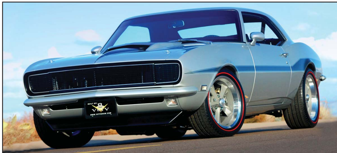
1968 Camaro "Reloaded" Built On www.V8TVshow.com

Please check fitment and clearances before ordering. We cannot accept any returns or exchanges.