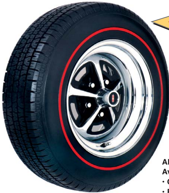
UTQG 440 AB